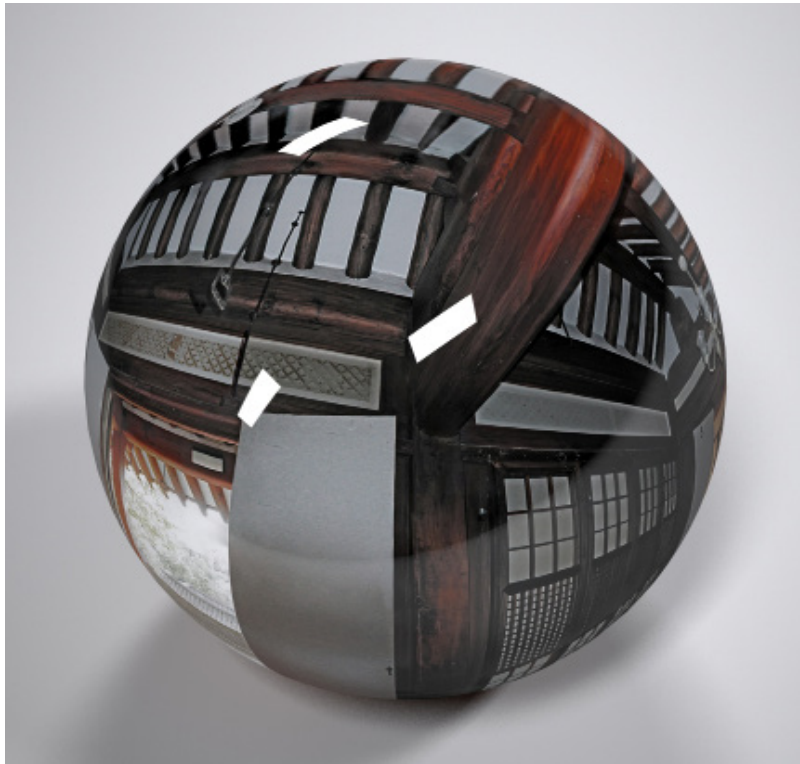
Seokpacheon Hanok , 2016. Photographic Sculpture, 30 cm diameter. Edition of 5.

Hanmi Gallery Seoul | 5th May - 28th May 2016